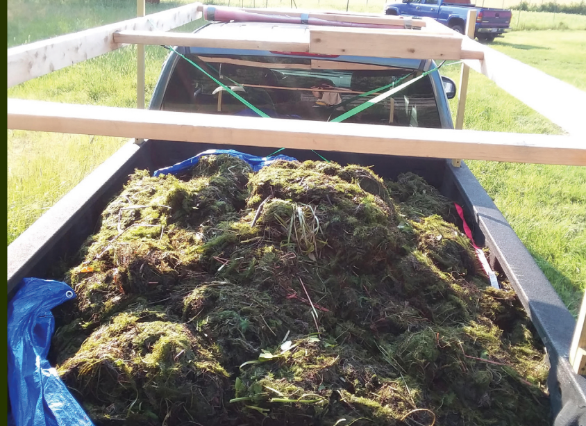
New England Milfoil and the 7 Lakes Alliance crew removed almost 17,000 gallons of invasive milfoil from Great Meadow Stream and Great Pond again this year. Great work guys!